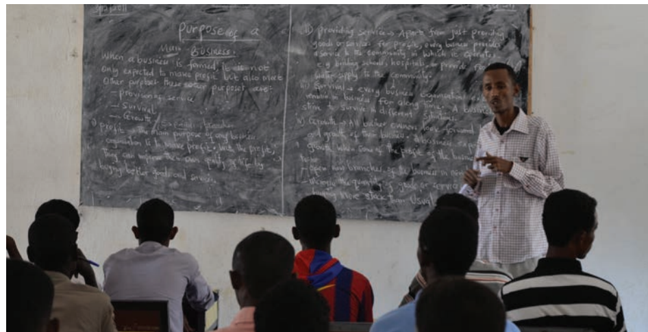
Youth-at-Risk Skills Training, Bosasso

The international community has increasingly focused attention on young people in the context of its conflict prevention and recovery programming efforts. It is said that young people face the major burden of war and violence. "These young people often face the additional barriers of a lack of sufficient education, health care, protection, livelihood opportunities, recreational activities, friendship, and family support" (Youth and Peace building, USIP). Crisis, conflicts and wars will remain unavoidable if we do not engage youth constructively in the shaping of the social contract 27 . The rationale for these interventions is often linked to preventing violence and/or reinforcing peace, based on the underpinning assumption that youth can be both a threat to peace and a force for peace . 28 In times of conflict, young people are particularly affected by the collapse of education and employment opportunities; they are the segment of the population that is most likely to be recruited into fighting forces, and are the most vulnerable to increased risk of HIV and other sexually-transmitted diseases and sexual violence. On the other hand, violent conflict often brings about rapid changes in social norms, and opens up opportunities to renegotiate relations and hierarchies based on age and gender. During periods of conflict, alternative political structures might emerge that are more inclusive of women and/or youth. After conflict, youth are often