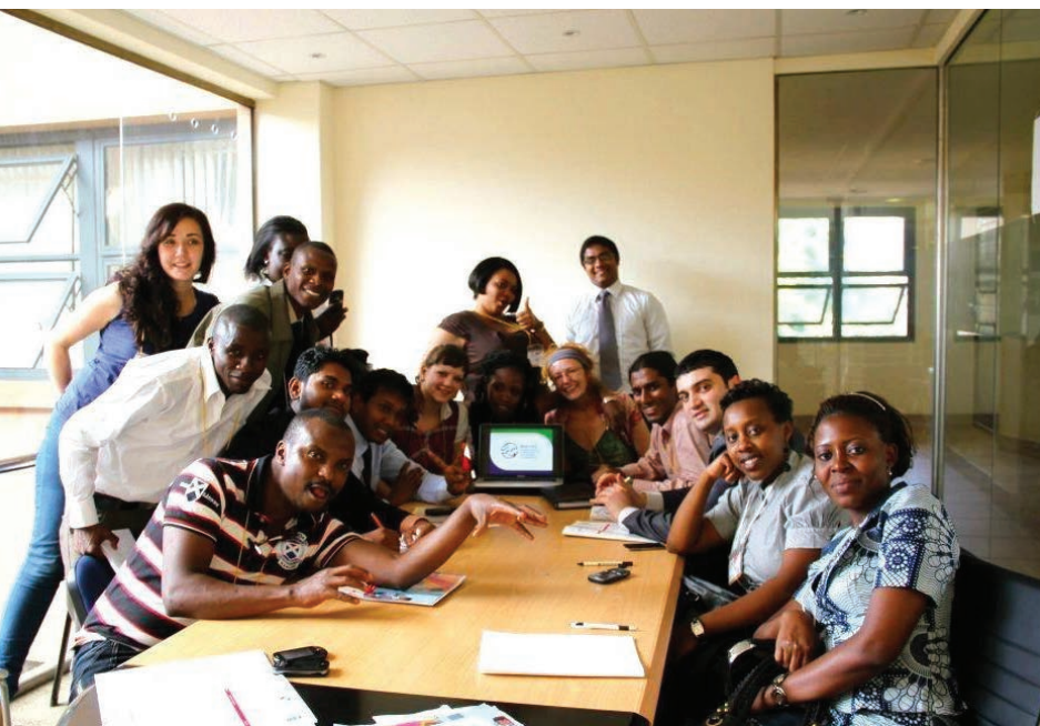
Youth21 breakout session