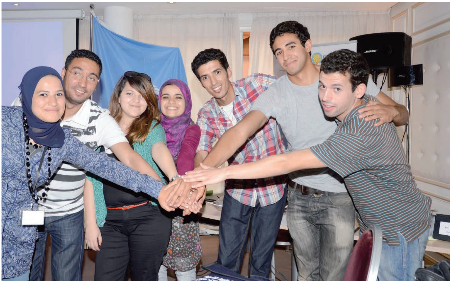
Regional programme on Arab youth volunteering for a better future