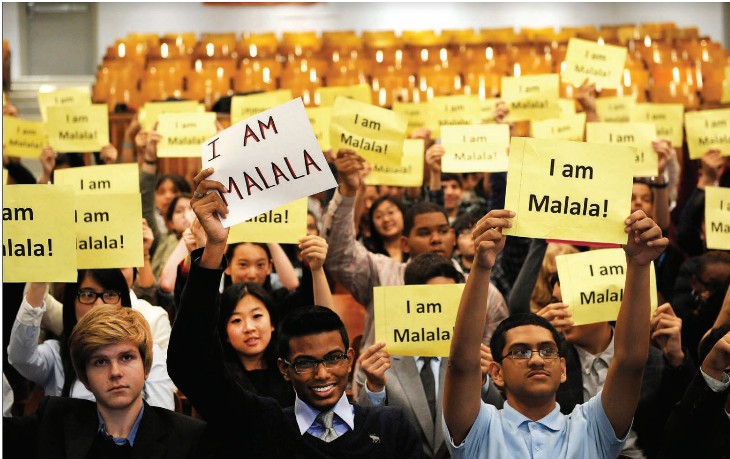
Students in solidarity at NEST+m school in New York

bringing innovative perspectives to this pressing global issue. (Outputs 5.2, 5.4, 6.1)