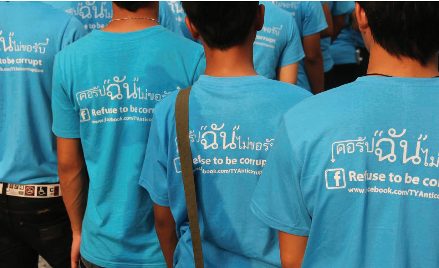
Youth demonstration against corruption, Thailand

UNDP’s strategic entry points for promoting economic empowerment of youth include: