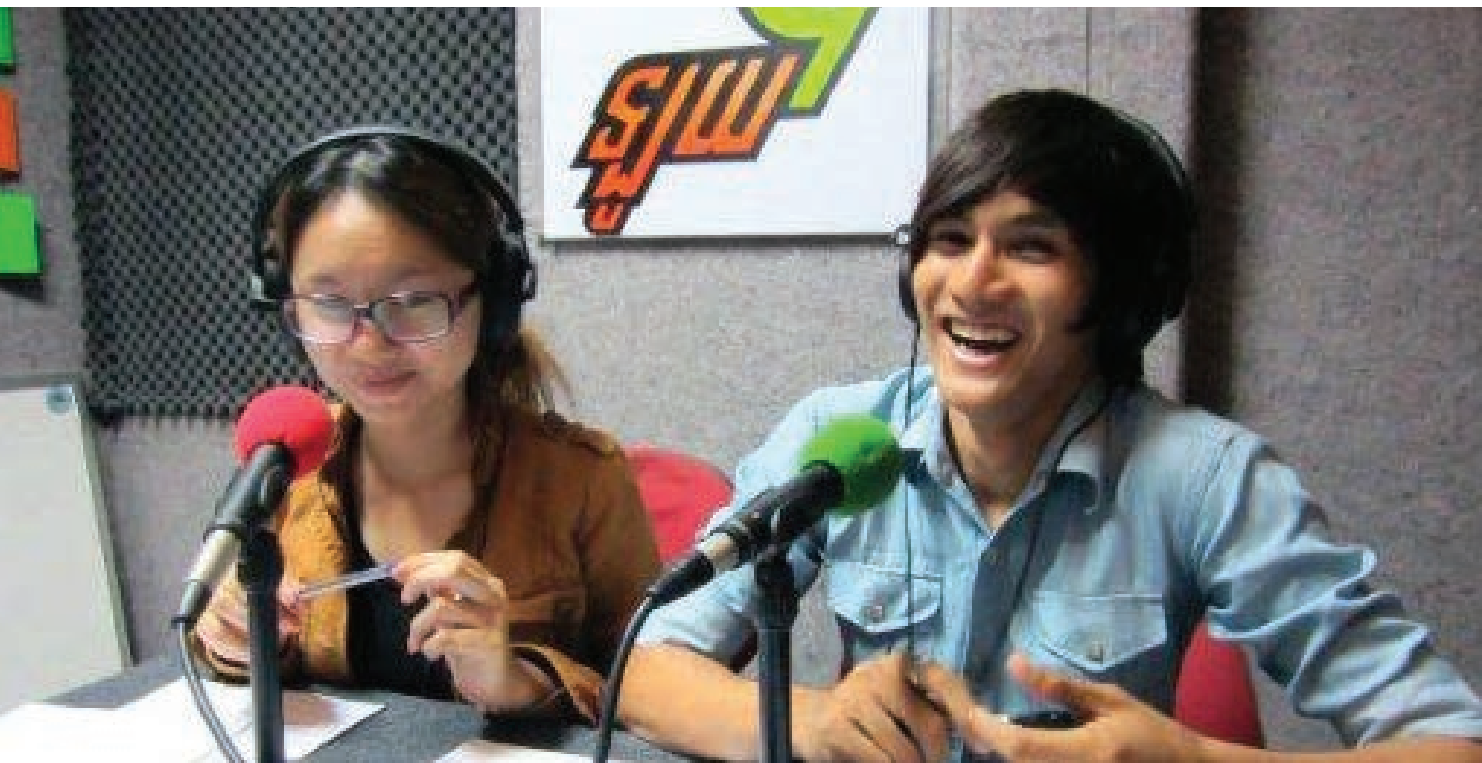
Civic education radio campaign (Cambodia, 2012)

UNDP's Youth Strategy seeks to address the aspirations of youth and to create opportunities for their perspectives to be brought into development discussions, formal planning, programming, decision-making processes, etc. This includes (a) the availability of formal and informal platforms that young people – including the most vulnerable, marginalized or excluded - can use to voice their perspectives, opportunities for young women and