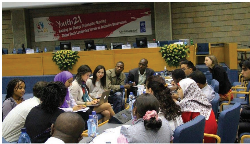
Youth 21, Nairobi, 2012

Promoting youth participation in formal processes, platforms and institutions should aim for achieving levels comparative to those of the rest of the population. There is strong evidence that the participation of young people