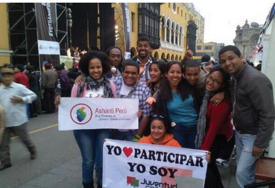
Juventud con voz

UNDP has the unique advantage of infusing youth voices and ensuring inclusion of youth issues within the development priority areas of poverty reduction, democratic governance, crisis and recovery, environment and energy, health and HIV and women's empowerment as a model for effective youth engagement. Within the Post-2015 paradigm, UNDP will contribute to youth mainstreaming in all relevant areas, participation in national consultations and in global conversations, but also in the subsequent phases, by providing evidence and insight on the development of relevant indicators and targets on youth.