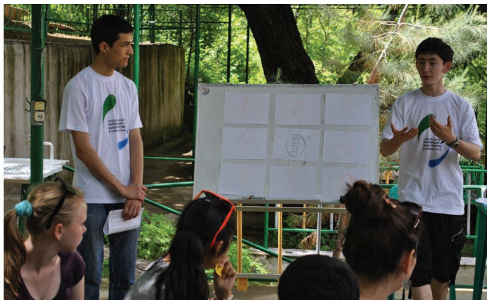
Volunteers inspire peers on social innovation and volunteerism for MDG achievement, Uzbekistan

To ensure a cohesive, comprehensive approach to the economic empowerment of youth, UNDP will collaborate to the extent possible with ILO and other UN agencies and partners working on youth issues by leveraging on the expertise of each agency.