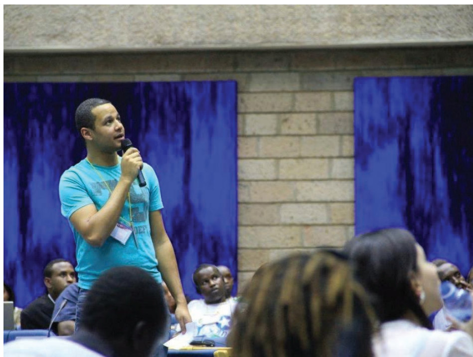
Youth 21, Nairobi, March 2012

UNDP recognizes that several groups of young men and women require specific attention as they face particular challenges such as exclusion, inequality and multiple forms of discrimination. These groups include young men and women from indigenous, ethnic and minority groups, migrants, refugees and IDPs, LGBT, those living with HIV, young people with disabilities or living in conditions of poverty and/or conflict, young sex workers and drug users, the digitally