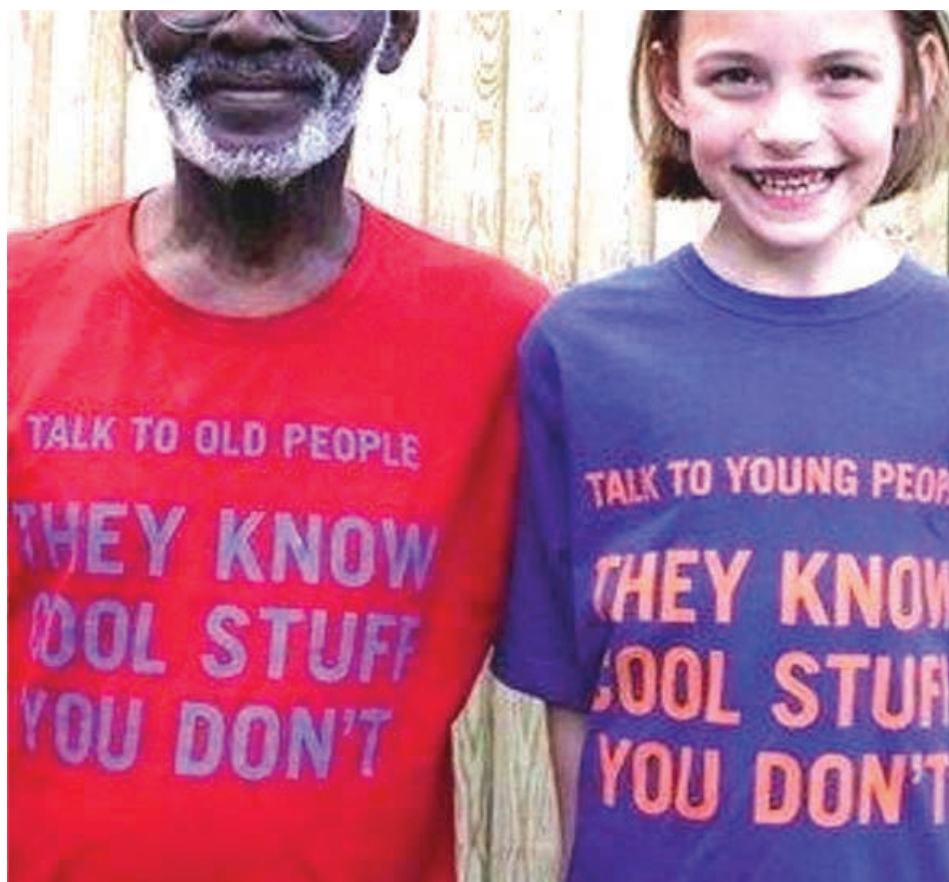
The Inter-generational approach

UNDP shall proactively engage with youth experts and practitioners, youth organisations, civil society organisations working with young people, and expert groups on youth in order to engage with and reach out to young people. Support to and partnership with youth organisations will aim to facilitate young peoples' empowerment and action in their areas of interest, as well as their representation and participation in youth policy-making and programming processes at all levels; and will aim to strengthen youth advocacy efforts through skills building and capacity development. UNDP shall seek expanded partnerships with global, regional and national youth research groups and youth associations in order to support as