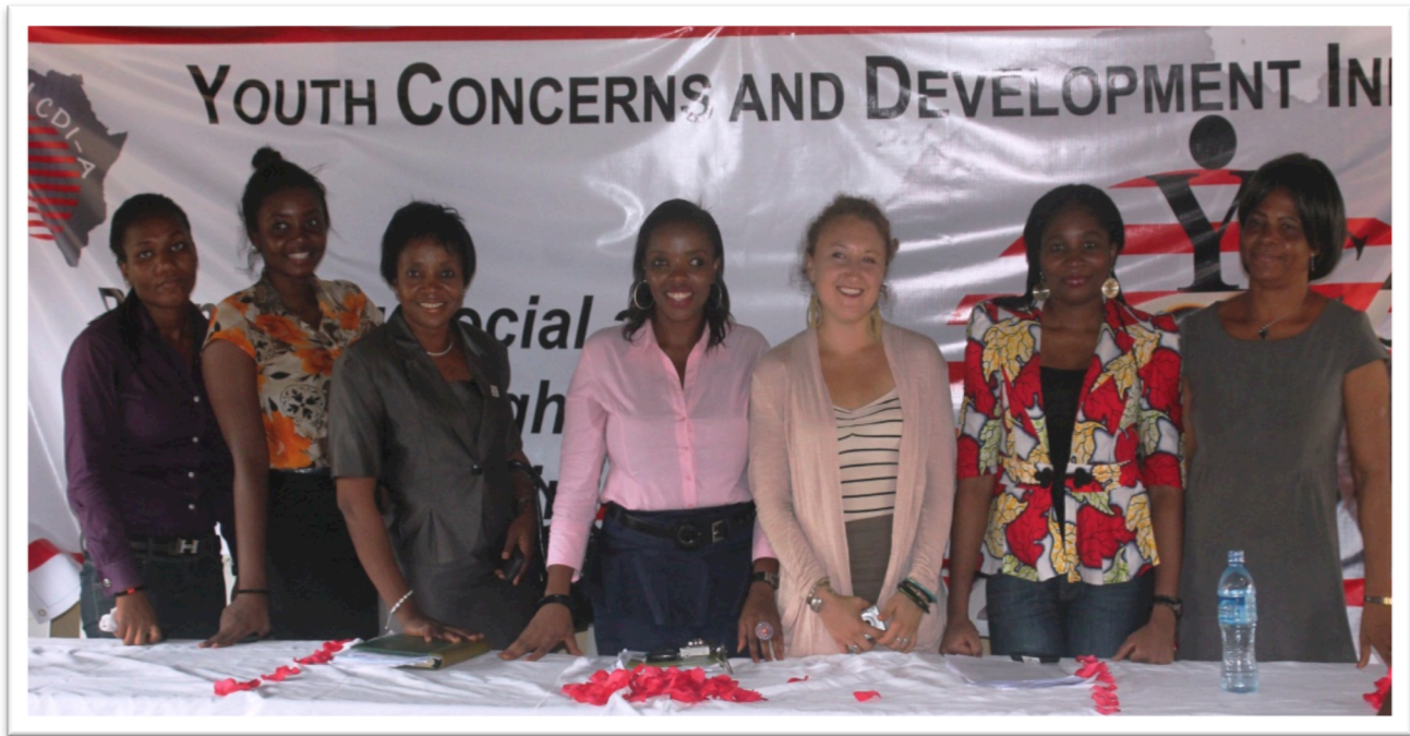
The YCDI-Africa Safety and Security Project Management Team in Ogudu senior High school, Hillview Estate, Ogudu GRA.

In line with the above, YCDI-Africa in collaboration with the Health and Life Planning Club, a school-based youth club, with the support from other stakeholders organized an interactive forum on safety and security for students on the 5 th of December, 2012. The forum held at Ogudu Senior High School, Hill view Estate Ogudu GRA, Ojota, Lagos.