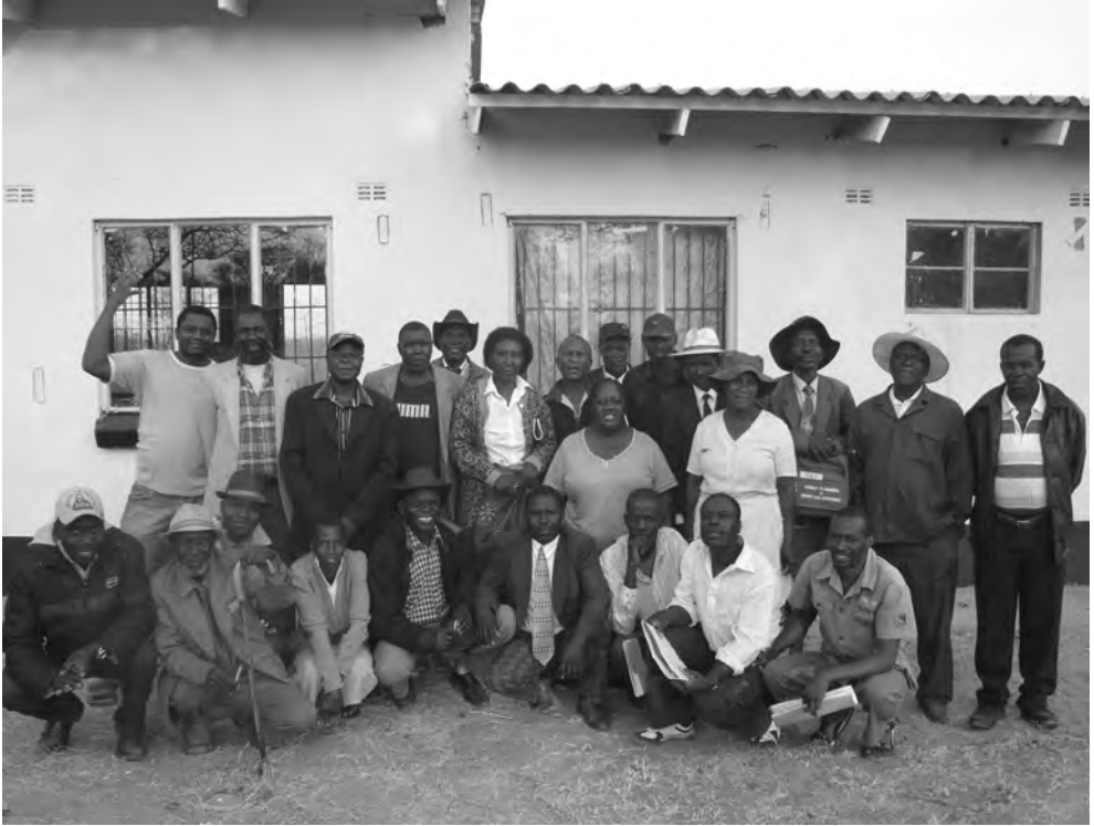
BUIYSAP and youth members with local traditional leaders after a meeting to discuss school drop-out rates in Nkayi.

to mitigate these barriers. In one case, it was clear that the village headman had more power than the so-called ‘shadow leaders’ instigating the conflict, and through engagement with him, BUIYSAP could continue to work in that area.