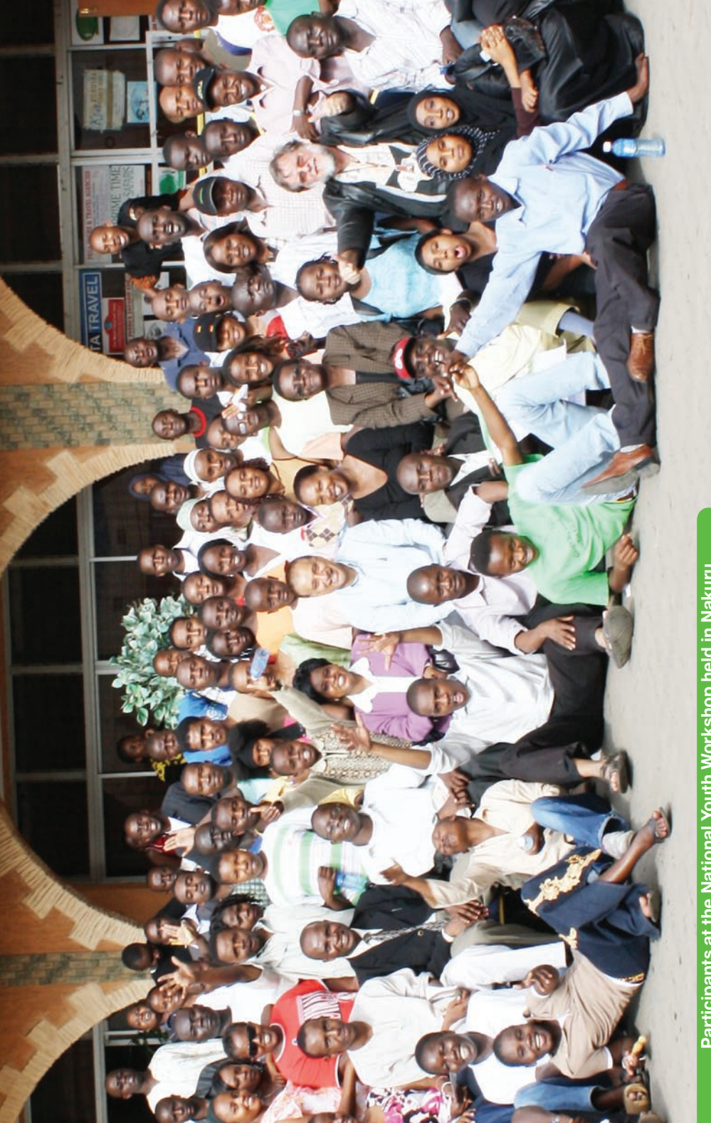
Participants at the National Youth Workshop held in Nakuru.