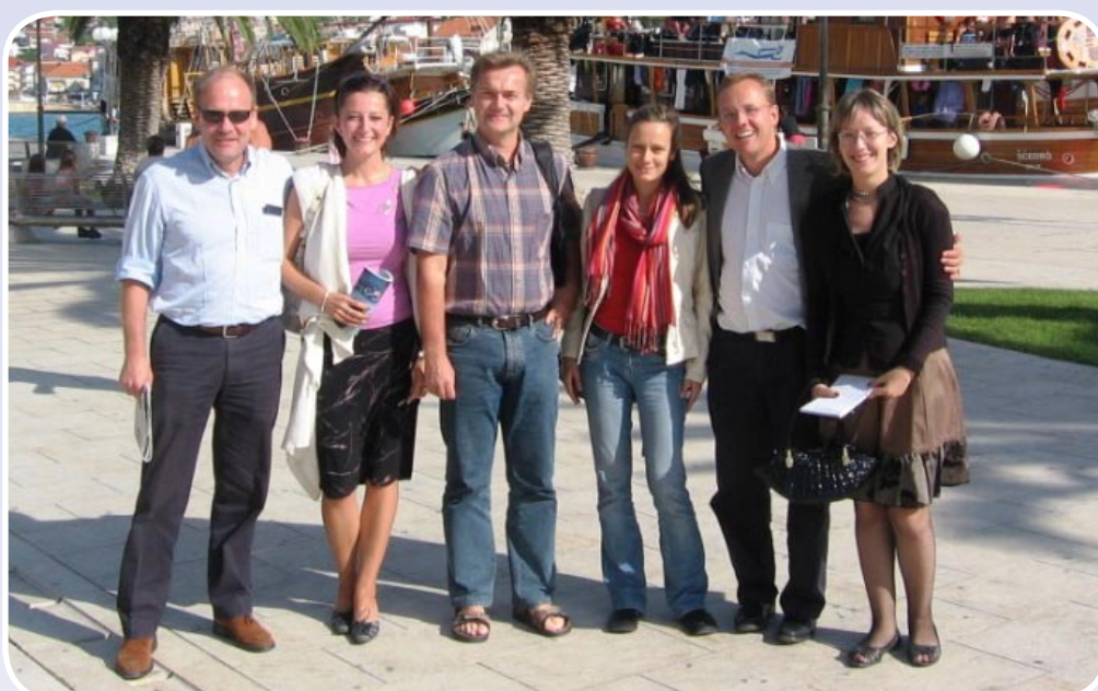
An evening visit to Trogir